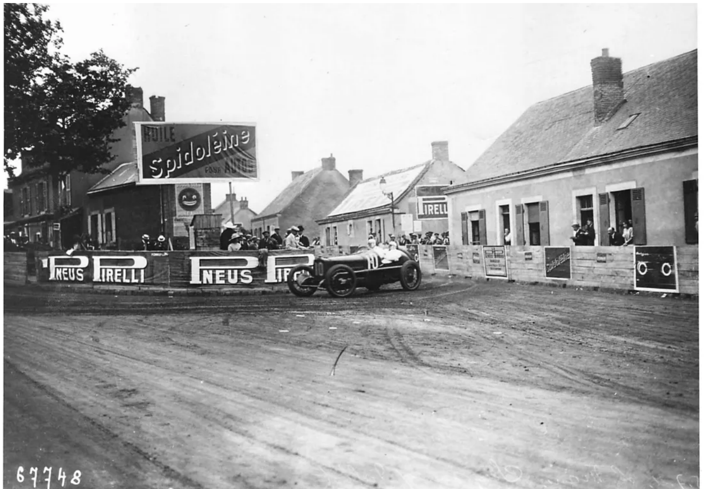
ISLE OF MAN