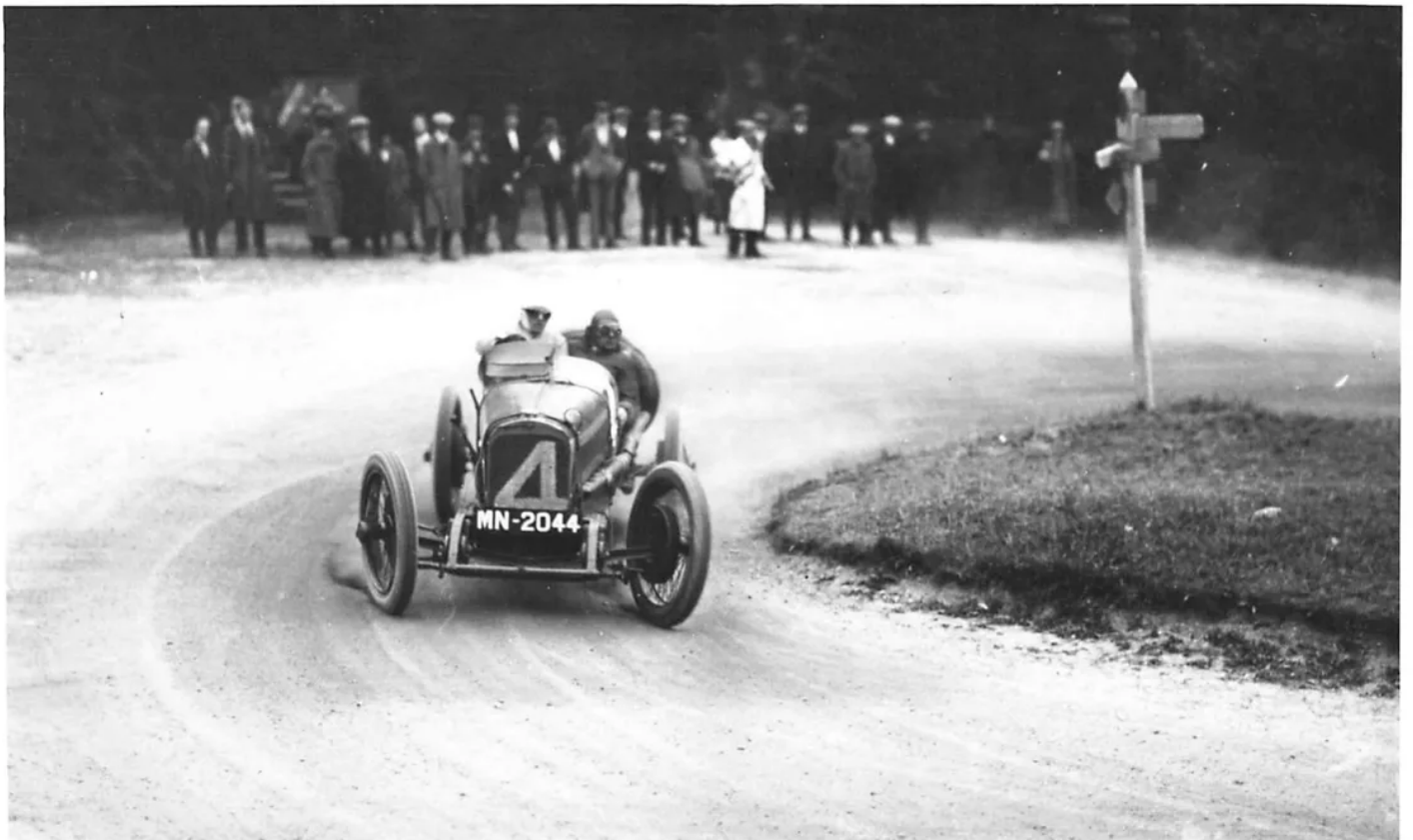
H-O-D. Seagrave 8 cyl SUNBEAM at Ramsey during practice He did a lap