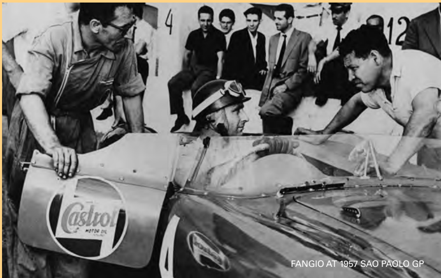
FANGIO AT 1957 SAO PAULO GP