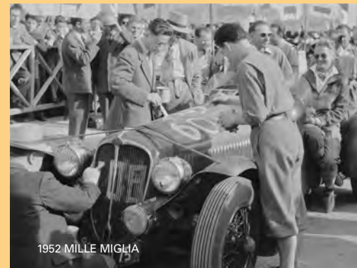
1952 MILLE MIGLIA