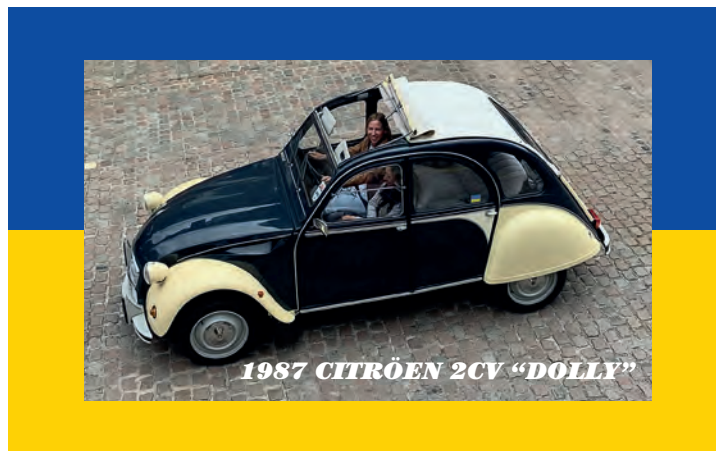
1987 CITRÖEN 2CV "DOLLY"