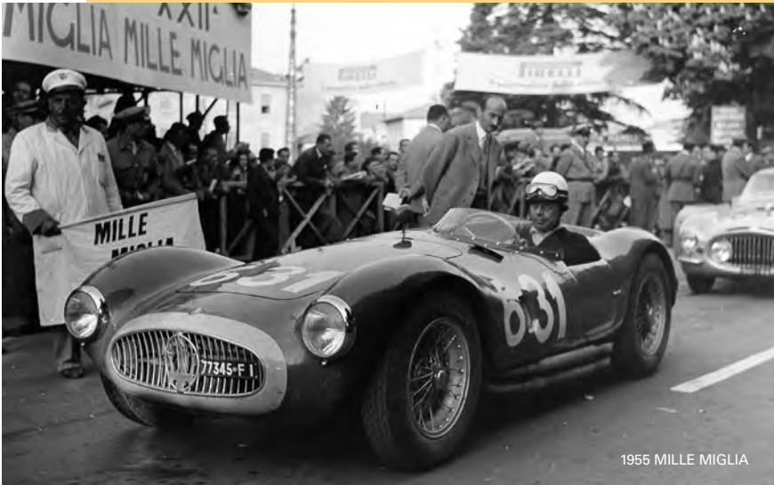
1955 MILLE MIGLIA

Eligible for MILLE MIGLIA, LE MANS CLASSIC, PETER AUTO EVENTS, GOODWOOD