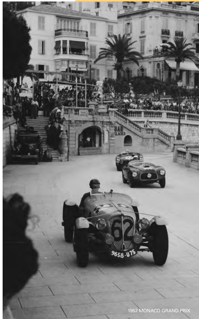
1952 MONACO GRAND PRIX