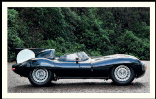
Above left: 1930 BUGATTI TYPE 46 TOURER Above right: 1955 JAGUAR D-TYPE 1963 JAGUAR E TYPE LIGHTWEIGHT, 86PJ, EX-ROY SALVADORI